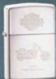
No. 250HD H112 High Polish Chrome 1980 FXST Softail