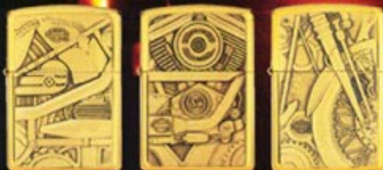
HDPP-6 6 Piece Puzzle/Brass

Since its inception in 1987, Barrett-Smythe has won global acclaim for superb design and faultless execution in creating fine collectibles.