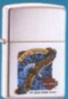
No. 250HD 1062 High Polish Chrome Soaring Eagle