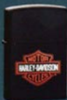
No. 218HD 621 Black Matte Harley-Davidson Logo