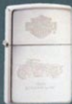
No. 250HD H106 High Polish Chrome 1920 Stream-Line