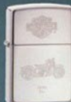
No. 250HD H107 High Polish Chrome 1930 EL