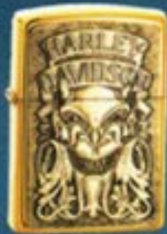
No. 254005HD H40 Solid Brass/Brass Emblem Devil