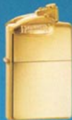
No. 250GHD H144 Gold Electroplate Gas Tank