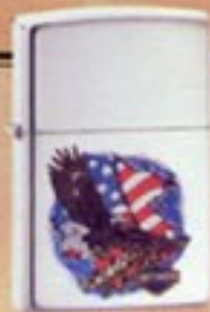
No. 250HD H1 High Polish Chrome Follow the Eagle