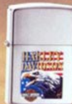
No. 250HD H8 High Polish Chrome Eagle/Flag