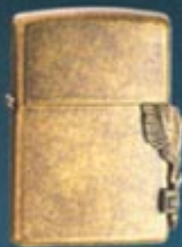
No. 2911HD H140 Antique Brass Side Mount Eagle Emblem