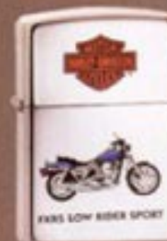
No. 250HD H100 High Polish Chrome FXRS Low Rider™ Sport