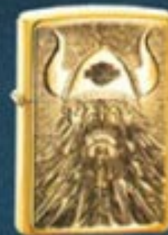
No. 254005HD H38 Solid Brass/Brass Emblem Viking