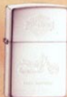
No. 250HD H96 High Polish Chrome FXDB Daytona