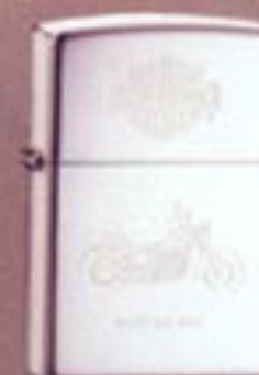
No. 250HD H95 High Polish Chrome FLSTF Fat Boy™