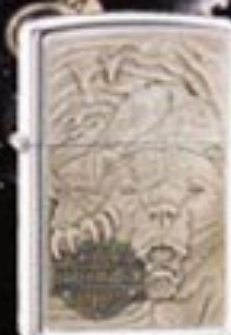
No. 250BSHD H171 Chrome/Pewter Emblem Bear