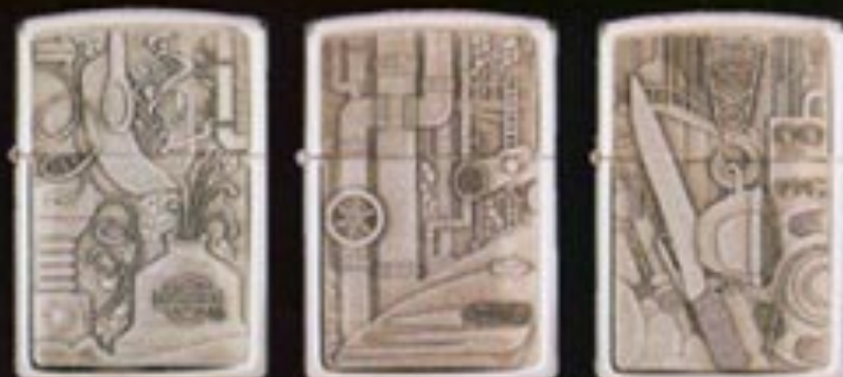
HDPP-6 6 Piece Puzzle/Pewter

Since its inception in 1987, Barrett-Smythe has won global acclaim for superb design and faultless execution in creating fine collectibles.