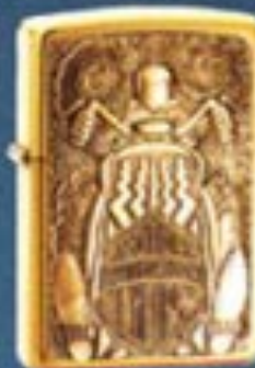
No. 254BBSHD H46 Solid Brass/Brass Emblem Tire Logo