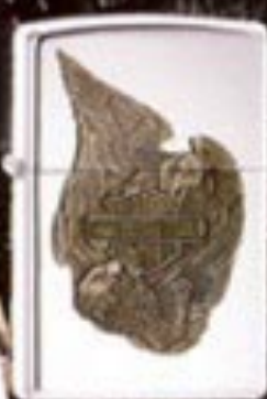
No. 250BSHD H177 High Polish Chrome Fighting Eagles