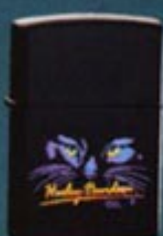
No. 218HD 1174 Black Matte Cat Eyes