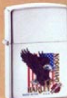
No. 250HD H6 High Polish Chrome Made in USA Eagle