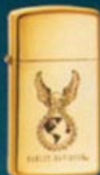
No. 1654HD 627 Solid Brass Harley-Davidson Eagle