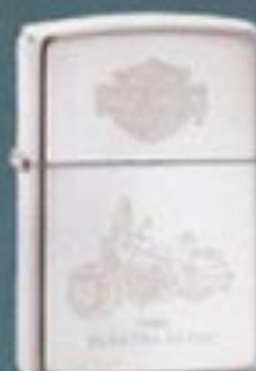
No. 250HD H110 High Polish Chrome 1960 Electra Glider