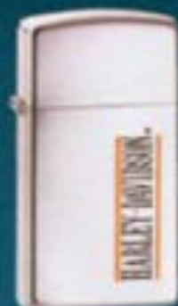
No. 1610HD 624 High Polish Chrome Harley-Davidson Vertical