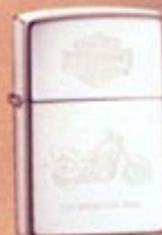
No. 250HD H97 High Polish Chrome XLH Sportster™ 1200