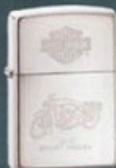
No. 250HD H105 High Polish Chrome 1910 Sport Model