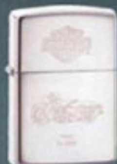
No. 250HD H108 High Polish Chrome 1940 74 OHV