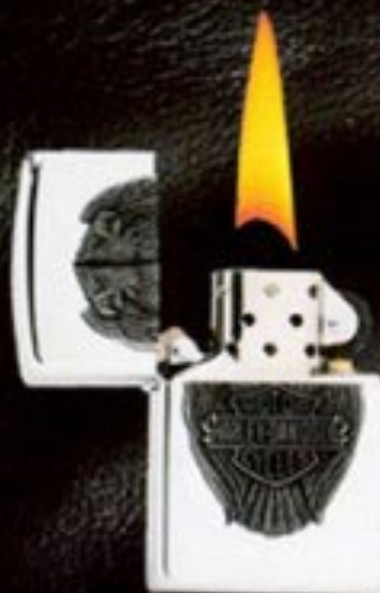
No. 250BSHD H165 High Polish Chrome Eagles Profile