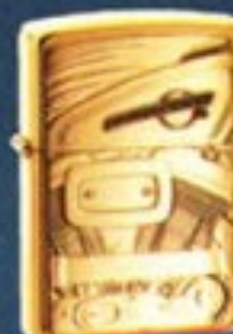
No. 254BBSHD H90 Solid Brass/Brass Emblem V-Engine