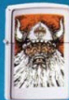
No. 250BSHD H33 High Polish Chrome Viking