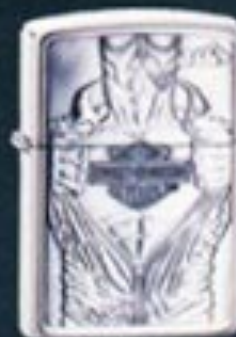
No. 25005HD H35 High Polish/Pewter Emblem Macho Man