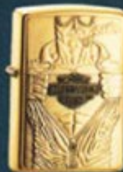
No. 254005HD H36 Solid Brass/Brass Emblem Macho Man