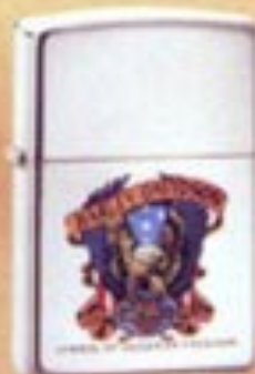
No. 250HD H5 High Polish Chrome Symbol of American Freedom