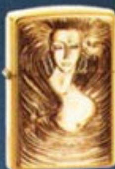
No. 254BBSHD H42 Solid Brass/Brass Emblem Girl with Earrings