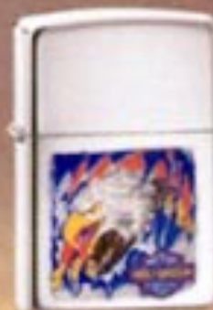
No. 250HD H56 High Polish Chrome Eagle with Talons

The inimitable spirit of freedom and adventure that characterizes Harley-Davidson ® is captured in vivid colors on Zippo high polish chrome lighters.