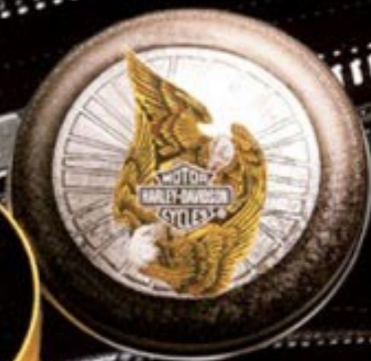
No. 254BBSHD H178 Brass Fighting Eagles With Tin