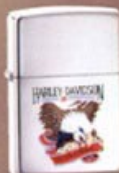
No. 250HD H10 High Polish Chrome Sink Your Claws