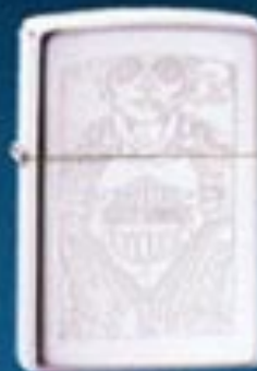
No. 250BSHD H151 High Polish Chrome Macho Man