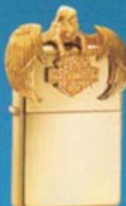
No. 250GHD H143 Gold Electroplate Eagle