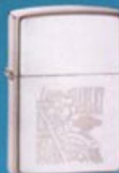
No. 250HD 1153 High Polish Chrome I Own a Harley