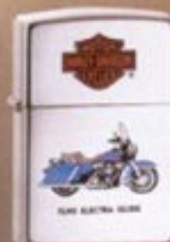
No. 250HD H98 High Polish Chrome FLHS Electra Glide™