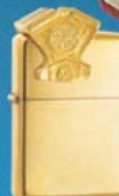
No. 250GHD H145 Gold Electroplate V-Engine