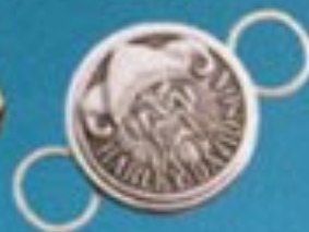
No. 5990HD 11138 Pewter Key Holder Viking