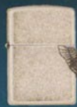
No. 121BSHD H173 Antique Silver Side Mount Logo & Wings