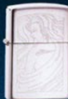
No. 250BSHD H149 High Polish Chrome Girl with Turban