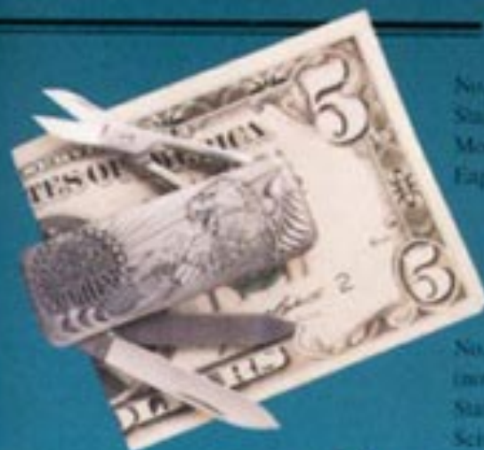
No. 7500MCHD 11135 Stainless/Pewter Emblem Money Clip Knife Scissors Eagle Stars & Stripes