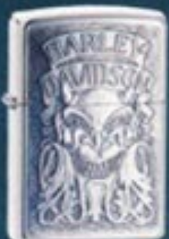
No. 25005HD H39 High Polish/Pewter Emblem Devil