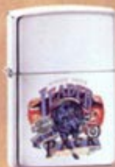
No. 250HD H2 High Polish Chrome Leader of the Pack