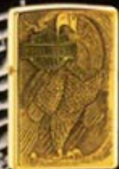
No. 254BBSHD H168 Brass/Brass Emblem Eagle on Perch