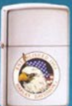
No. 250HD 660 High Polish Chrome Eagle 1903