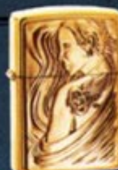
No. 254BBSHD H44 Solid Brass/Brass Emblem Girl with Tattoo