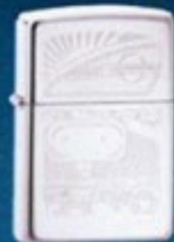
No. 250BSHD H150 High Polish Chrome V-Engine