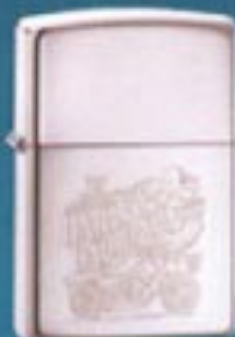
No. 250HD 1115 High Polish Chrome Built To Last