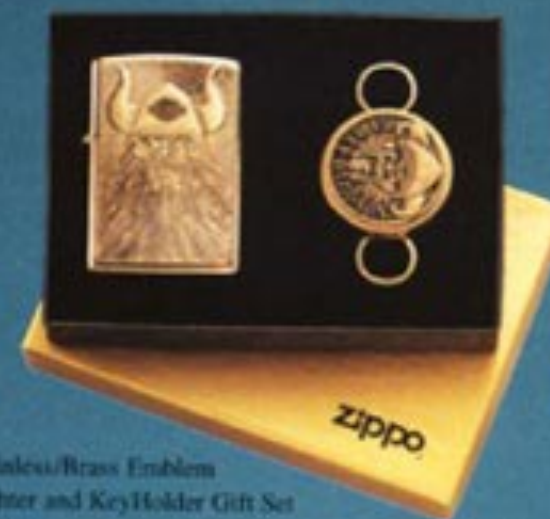
Stainless/Brass Emblem Lighter and Keyholder Gift Set Viking (Also available in Pewter)