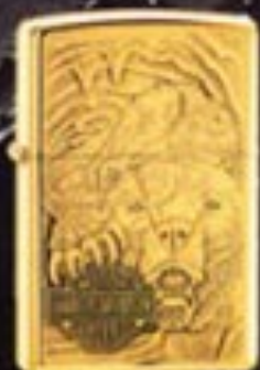
No. 254BBSHD H172 Brass/Brass Emblem Bear

Like a powerful Harley-Davidson ® machine, these wild creatures are ready to spring into action.