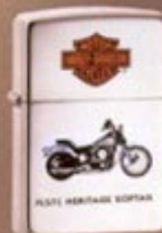
No. 250HD H99 High Polish Chrome FLSTC Heritage™ Softail™