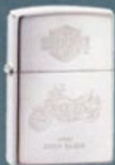
No. 250HD H113 High Polish Chrome 1990 Dyna Glider