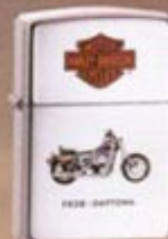
No. 250HD H102 High Polish Chrome FXDB Daytona