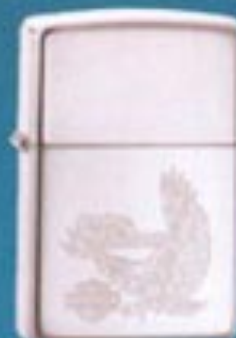
No. 250HD 1149 High Polish Chrome Flying Eagle