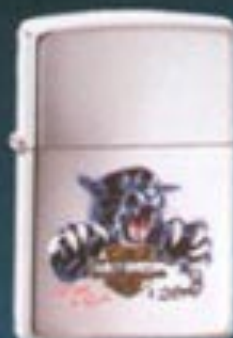
No. 250HD 1003 High Polish Chrome Chain The Power