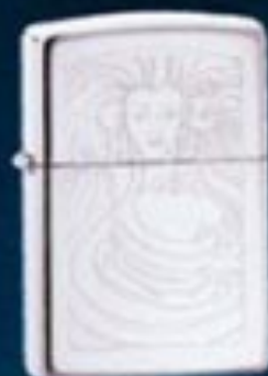
No. 250BSHD H148 High Polish Chrome Girl with Earrings