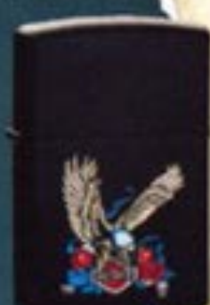
No. 218HD 1158 Black Matte Eagle with Rose