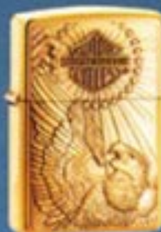
No. 254BBSHD H147 Solid Brass/Brass Emblem Eagle Stars & Stripes