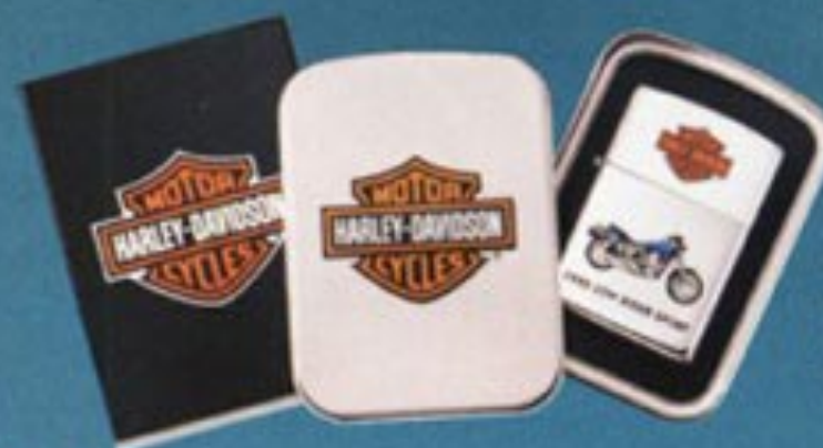
EHDT Harley-Davidson Individual Tin (Standard packaging for all regular Harley-Davidson lighters)