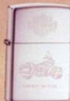
No. 250HD H92 High Polish Chrome FLHS Electra Glide™