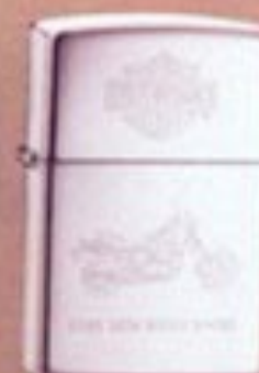
No. 250HD H94 High Polish Chrome FXRS Low Rider™ Sport