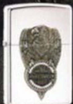
No. 250BSHD H175 Chrome/Pewter Emblem Eagle on Tire