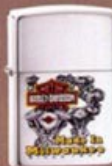
No. 250HD H71 High Polish Chrome Made in Milwaukee