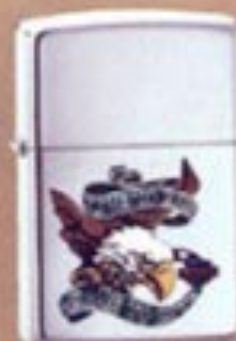
No. 250HD H3 High Polish Chrome Live to Ride