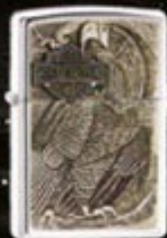
No. 250BSHD H167 Chrome/Pewter Emblem Eagle on Perch