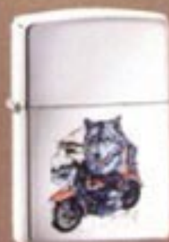
No. 250HD H9 High Polish Chrome Survivorz