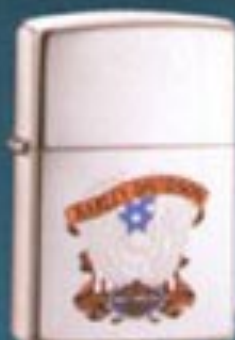
No. 250HD 1119 High Polish Chrome Symbol of American Freedom