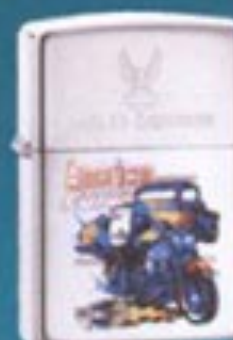
No. 250HD 1121 High Polish Chrome American Classic