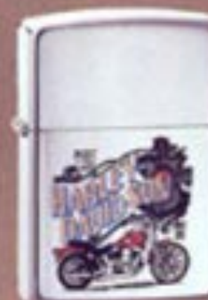
No. 250HD H4 High Polish Chrome Built to Last