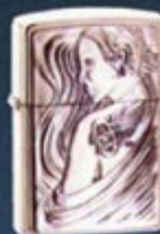
No. 250BSHD H43 High Polish/Pewter Emblem Girl with Tattoo