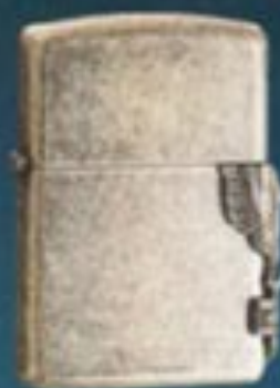
No. 1211HD H141 Antique Silver Side Mount Eagle Emblem