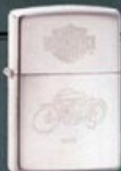
No. 250HD H104 High Polish Chrome 1900