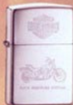
No. 250HD H93 High Polish Chrome FLSTC Heritage™ Softail™