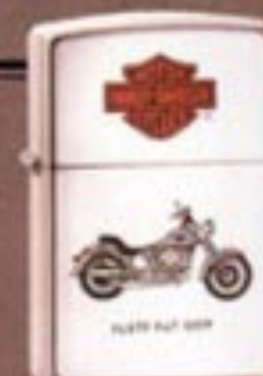
No. 250HD H101 High Polish Chrome FLSTF Fat Boy™