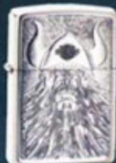
No. 25005HD H37 High Polish/Pewter Emblem Viking