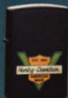
No. 218HD 620 Black Matte American Made