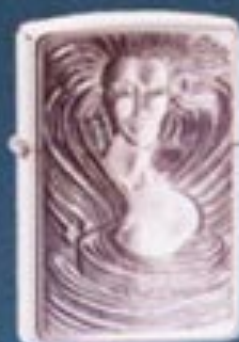
No. 250BSHD H41 High Polish/Pewter Emblem Girl with Earrings