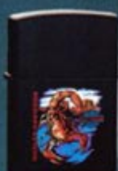
No. 218HD 1184 Black Matte Scorpion