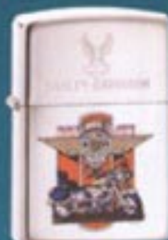
No. 250HD 1120 High Polish Chrome Fat Bike