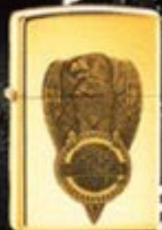
No. 254BBSHD H176 Brass/Brass Emblem Eagle on Tire