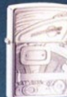
No. 250BSHD H89 High Polish/Pewter Emblem V-Engine