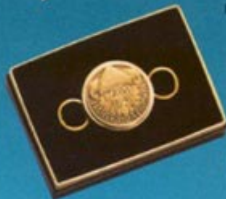
No. 5990BHD 11137 Brass Key Holder Viking