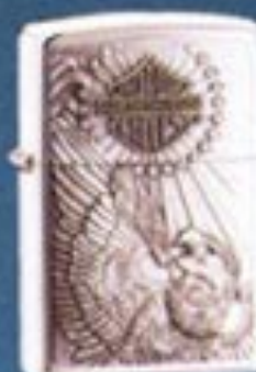
No. 250BSHD H146 High Polish/Pewter Emblem Eagle Stars & Stripes