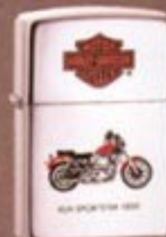
No. 250HD H103 High Polish Chrome XLH Sportster™ 1200