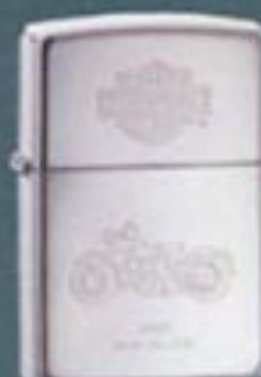
No. 250HD H109 High Polish Chrome 1950 Duo Glider