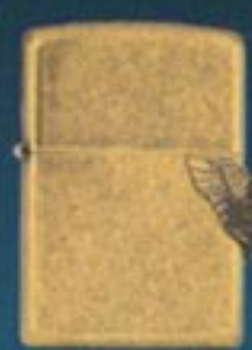
No. 201BSHD H174 Antique Brass Side Mount Logo & Wings