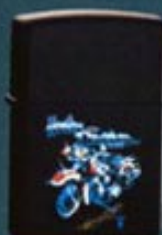
No. 218HD 1170 Black Matte Bike