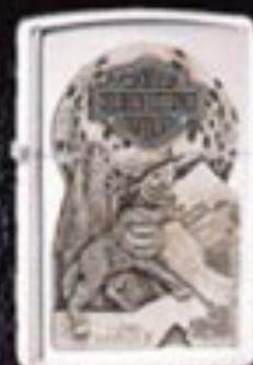
No. 250BSHD H169 Chrome/Pewter Emblem Wolf on Mountain