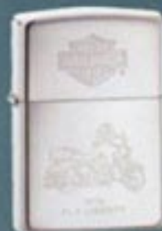
No. 250HD H111 High Polish Chrome 1970 FLH Liberty