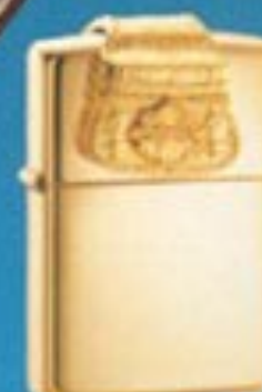
No. 250GHD H146 Gold Electroplate Saddle Bags