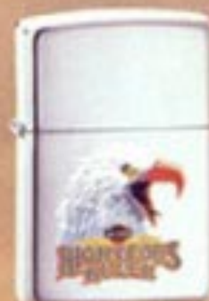
No. 250HD H7 High Polish Chrome Righteous Ruler