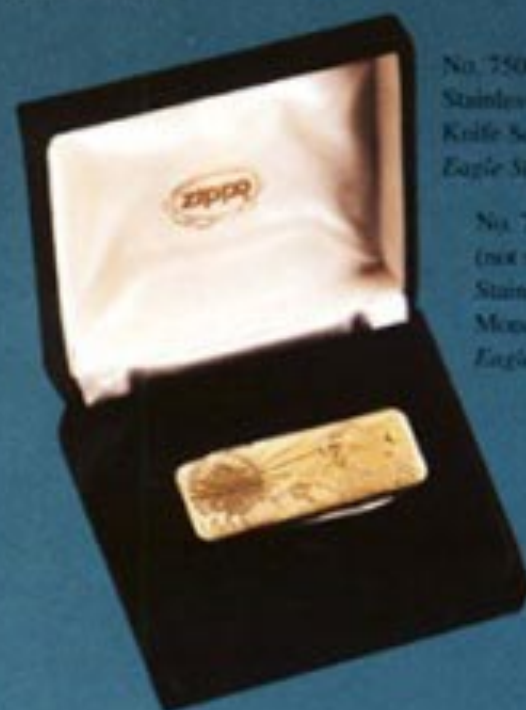
No. 7500HD H136 Stainless/Brass Emblem Knife Scissors Eagle Stars & Stripes