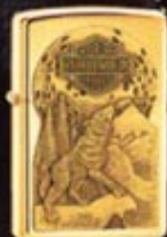
No. 254BBSHD H170 Brass/Brass Emblem Wolf on Mountain