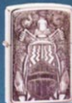
No. 250BSHD H45 High Polish/Pewter Emblem Tire With Logo