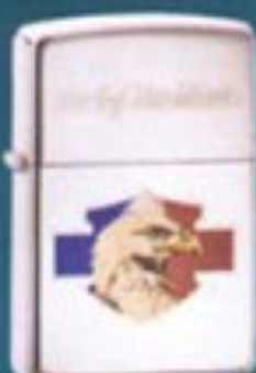
No. 250HD 1118 High Polish Chrome Soaring Eagle