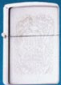
No. 250BSHD H152 High Polish Chrome Tire With Logo