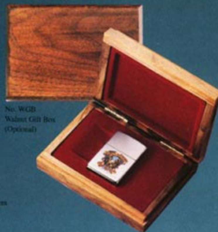
No. WGB Walnut Gift Box (Optional)